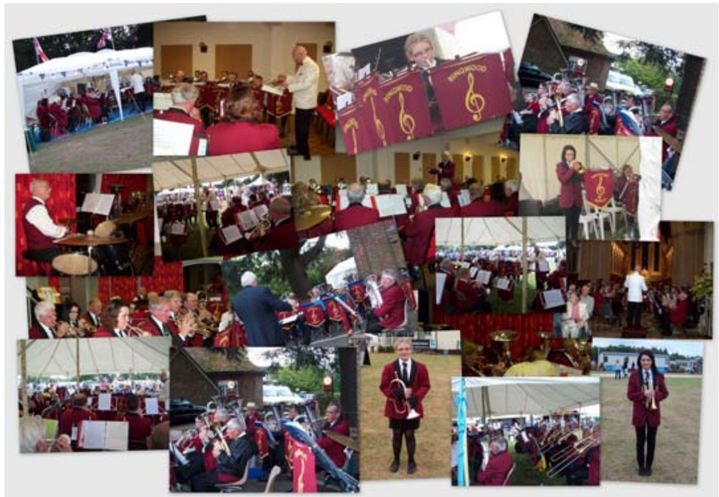
A collage of pictures of engagements we have undertaken during the past summer