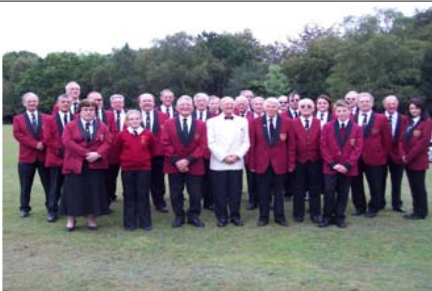
THE BAND AT BURLEY FOR THE BRITISH LEGION CONCERT

additional cornet players would be welcome